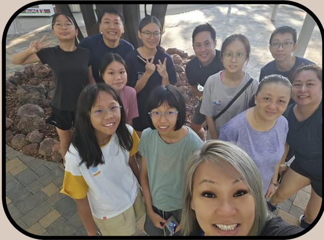
Training for Cross Country

Engaging activities that strengthen family connections.