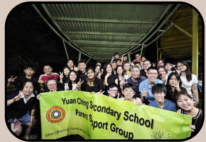
PSG Family Day BBQ