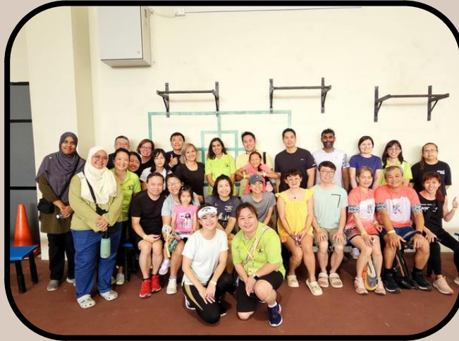
Cross Country Day